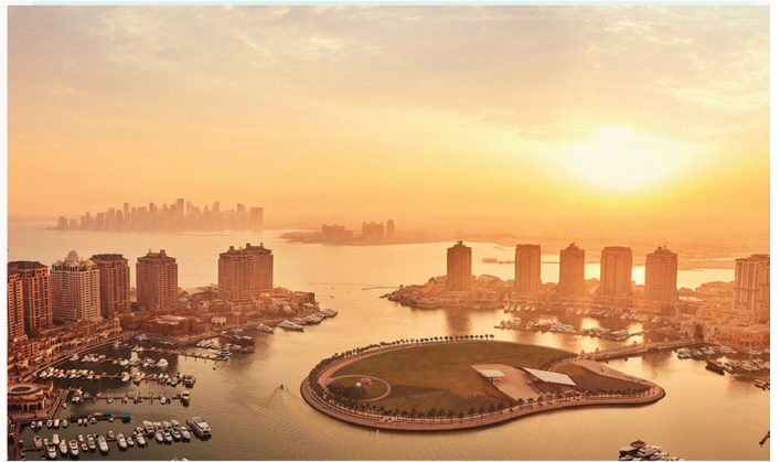
The Pearl, Qatar

A visit to Qatar means finding that centre point between contrasts few other landscapes can match. With our country's compact size and unique geography, you'll find desert dunes in reach of crystal-clear waters, and ultra-modern cities like our capital Doha surrounded with ancient villages and cultural wonders.